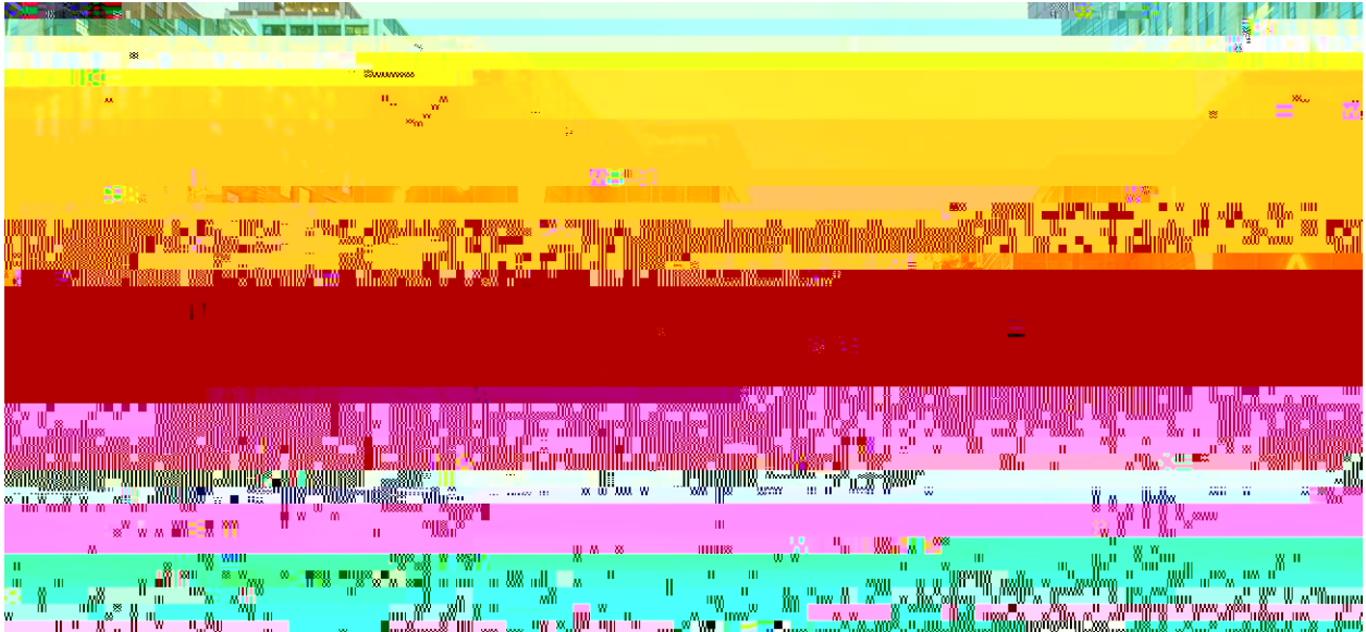
Museum of Contemporary Art in Chicago